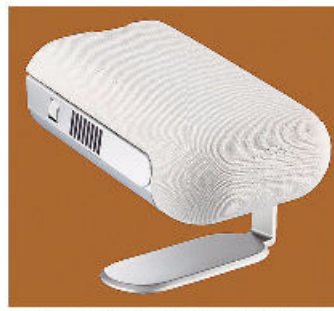
Carry case for the Viewsonic M1 Pro BIJOY GHOSH

The projector features a plastic focus ring on the left-hand side which can be used to tweak the focus. The ports are neatly tucked away behind the curved magnetic I/O cover on the left-hand side of the projector. The M1 Pro features a whole host of ports for connectivity which includes 2 Type-C