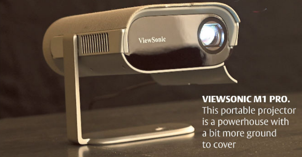
VIEWSONIC M1 PRO. This portable projector is a powerhouse with a bit more ground to cover