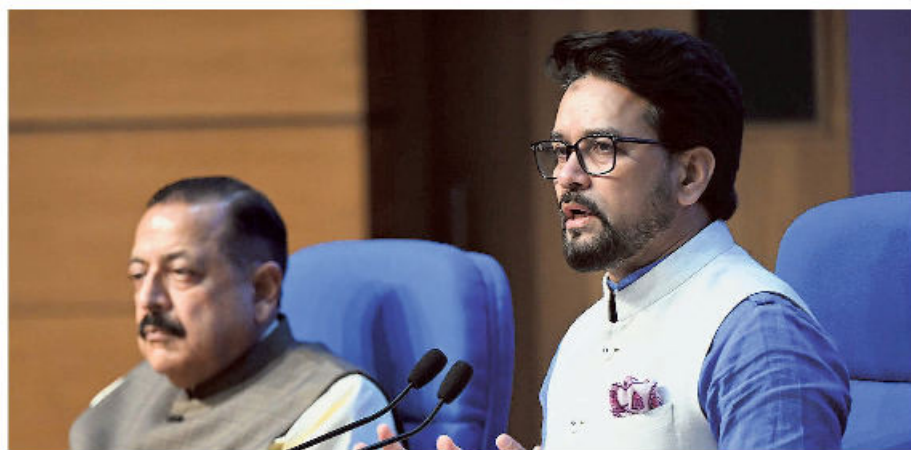
BIG MOVE. The Union Minister for Information & Broadcasting, Anurag Singh Thakur (right), and Minister of State for Science & Technology, Jitendra Singh, at a press conference in New Delhi on Wednesday.

"All the other countries are yet to develop applications for quantum computing and India is the latest addition to that list," Singh added. While traditional computing is wave-based,